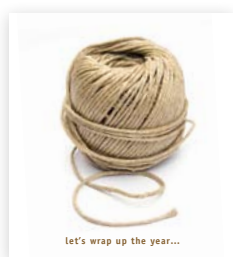
Version 1 (Contemporary)